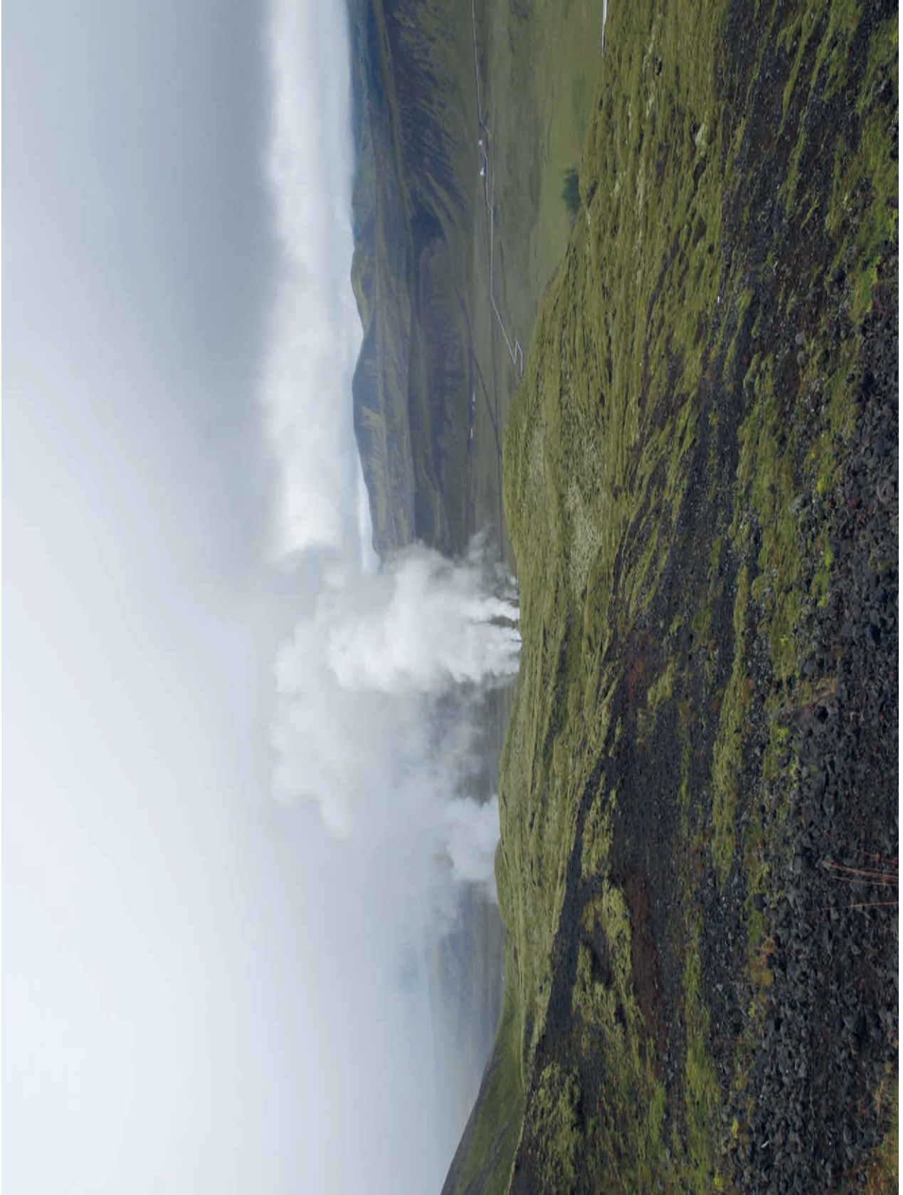
Photograph A for Question 1